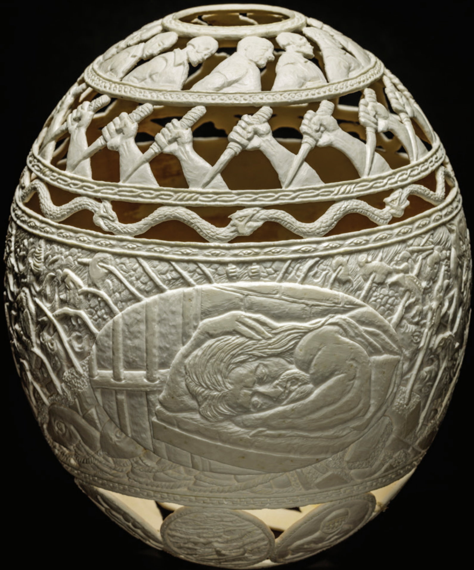
GIL BATLE, 50/51 DREAMS, carved ostrich eggshell, 2015, private collection

A BOX WITHOUT HINGES, KEY OR LID, YET GOLDEN TREASURE INSIDE IS HID.