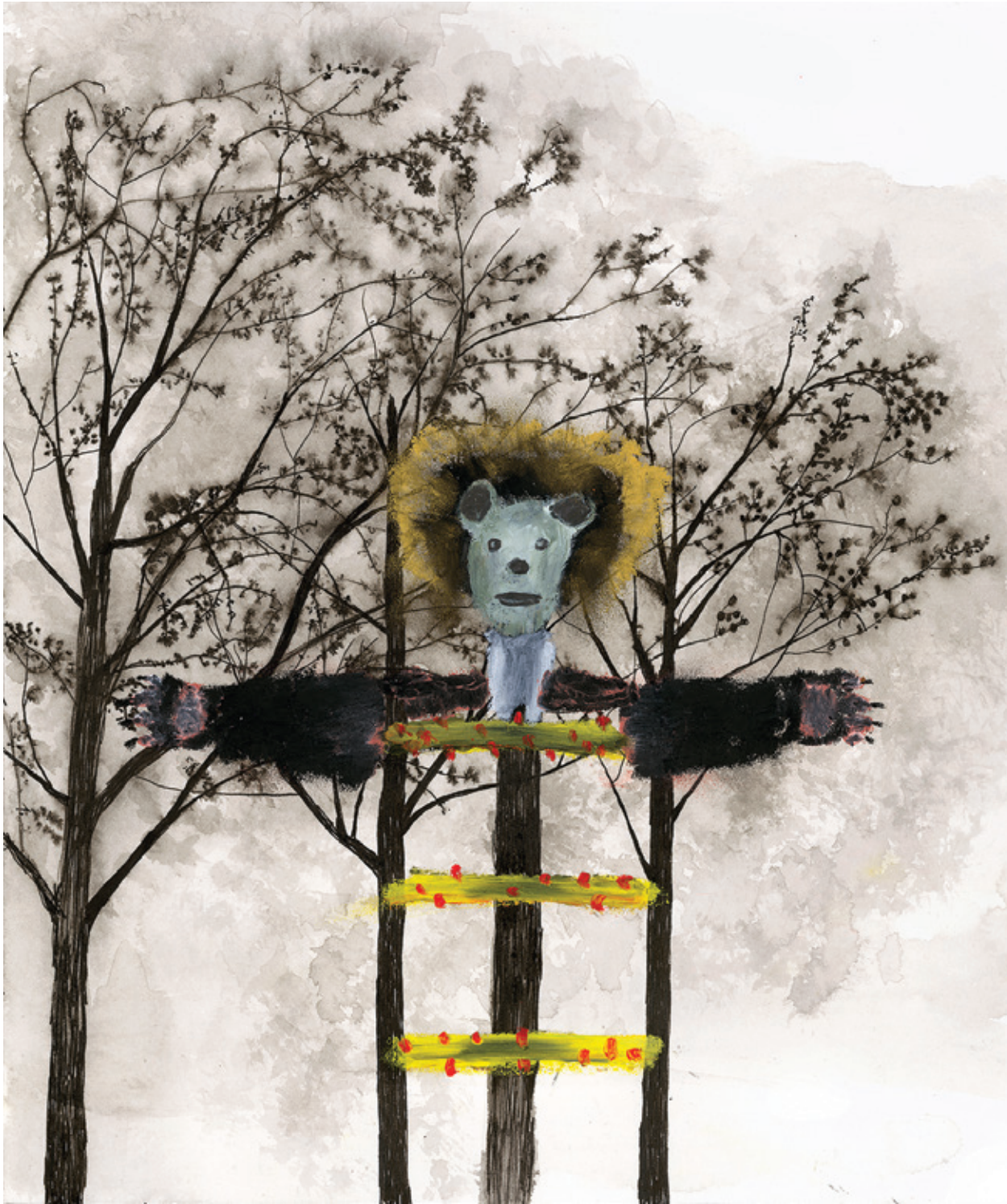
JOHN LURIE. THANKSGIVING HAS BEEN CANCELED. BEST WISHES. THE NATIVE AMERICANS, 2008. ink and oil pastel on paper, courtesy of the artist.

"AN ARMY MARCHES ON ITS STOMACH."—NAPOLEON BONAPARTE